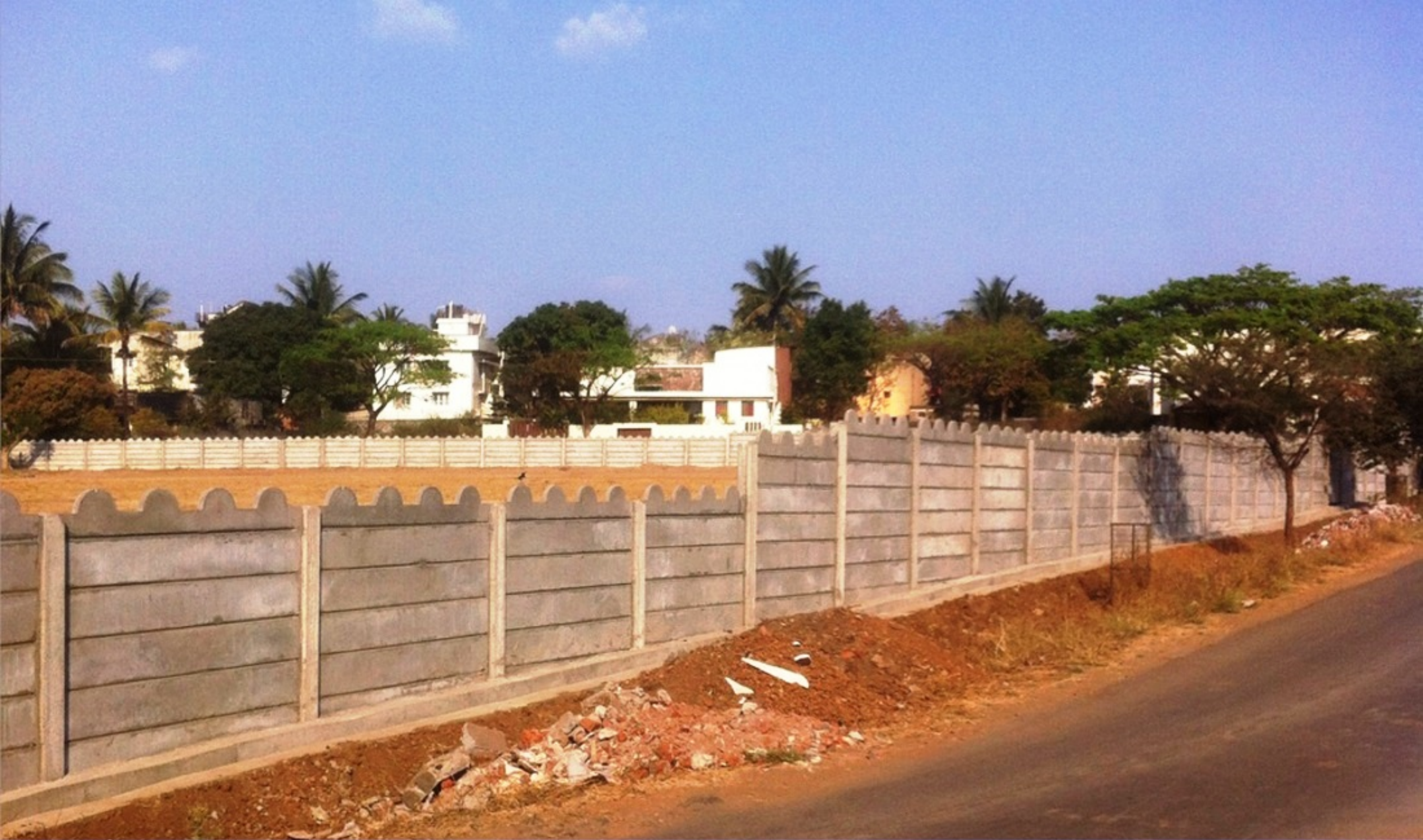
Housing Society Compound Wall