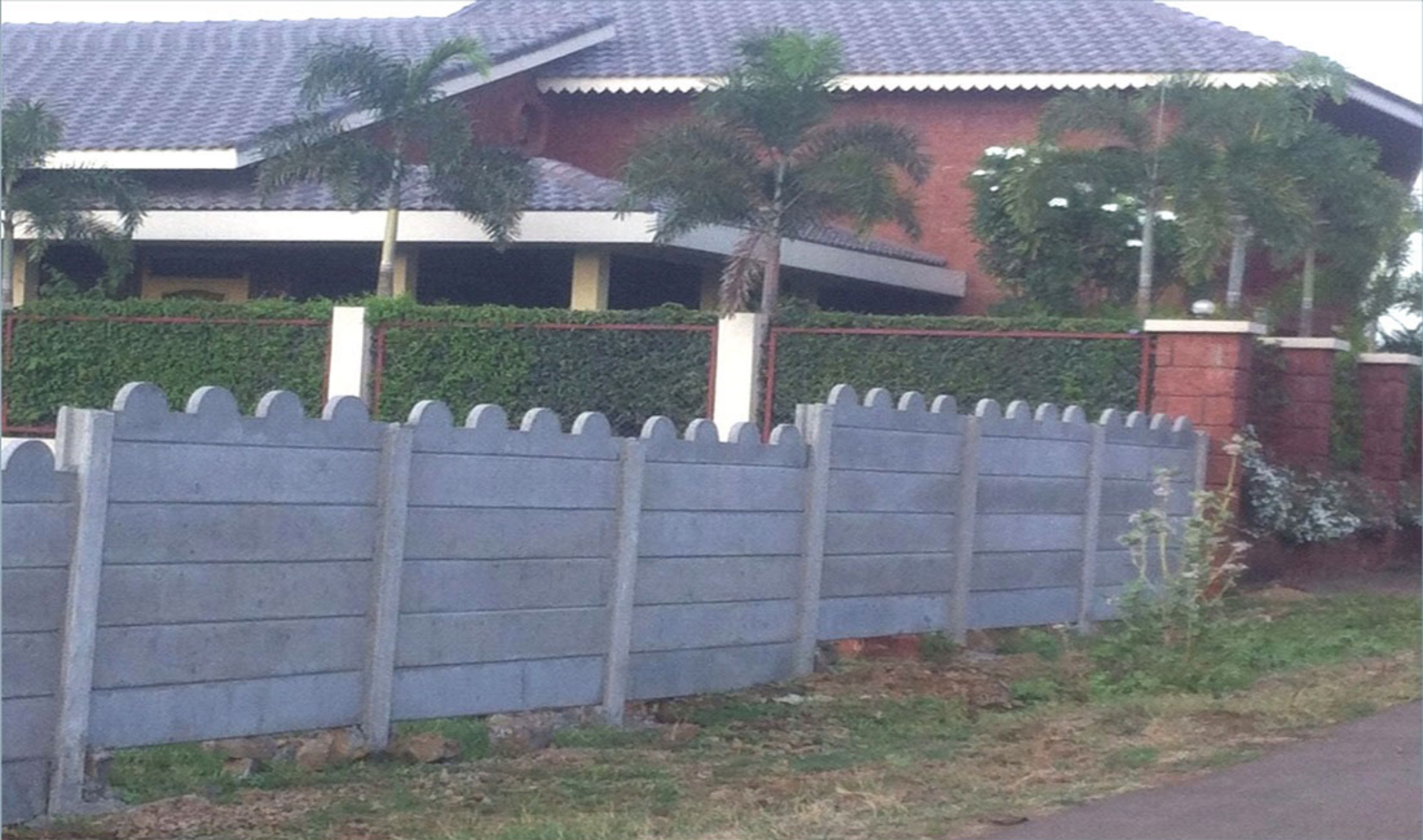
Industrial Compound Wall