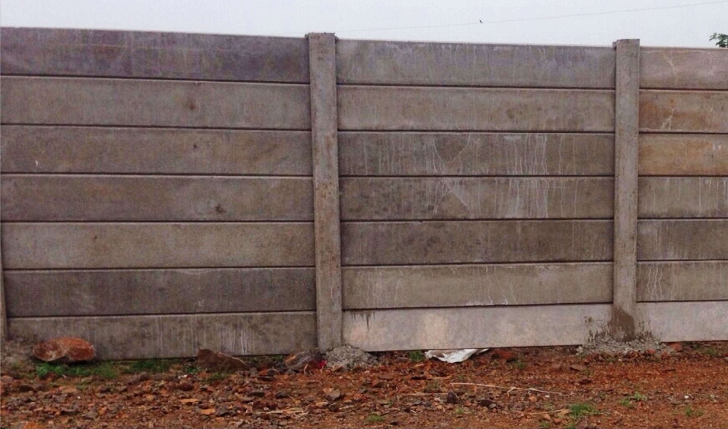
Warehouse Compound Wall