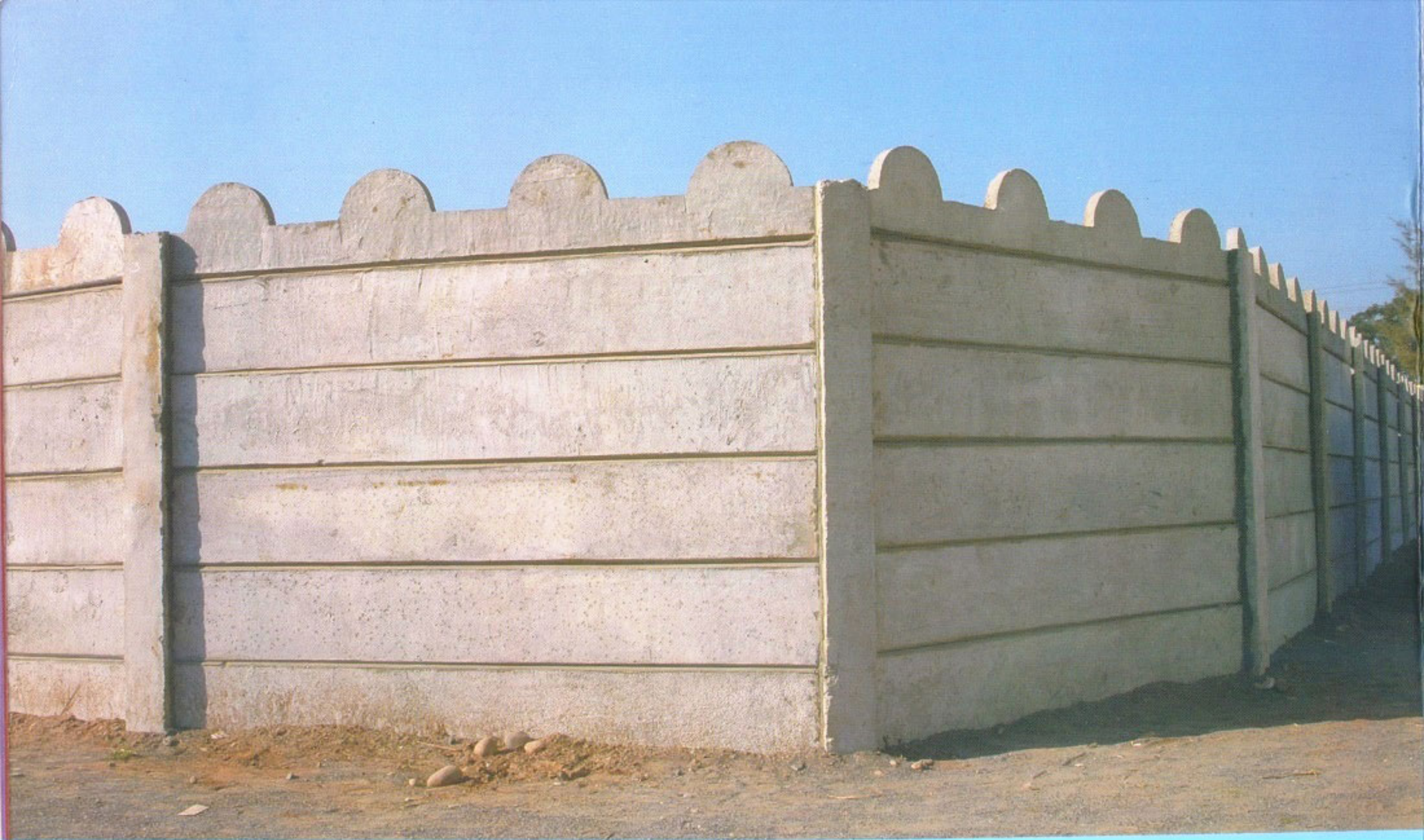
Final Finished Compound Wall